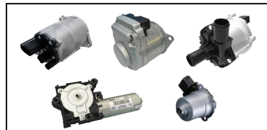
Motor-related products for automobiles

The three companies’ agreements regarding the JV as of now are as follows;