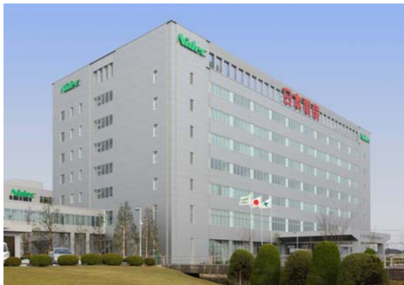
Main Laboratory Building