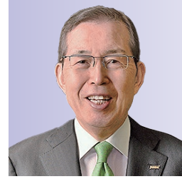
Shigenobu Nagamori Founder and Chairman of the Board Nominating Committee Member Remuneration Committee Member

(Born on August 28, 1944) Number of the Company's shares possessed: 49,473,000