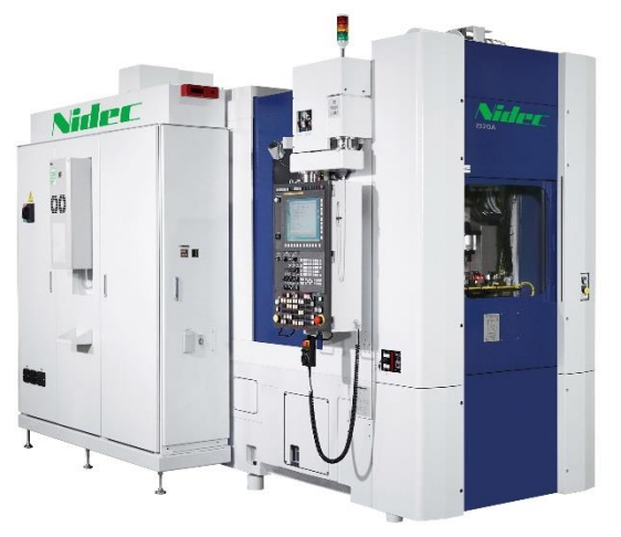
ZI20A, an internal generating gear grinder for mass production

Process principle of internal generating grinding