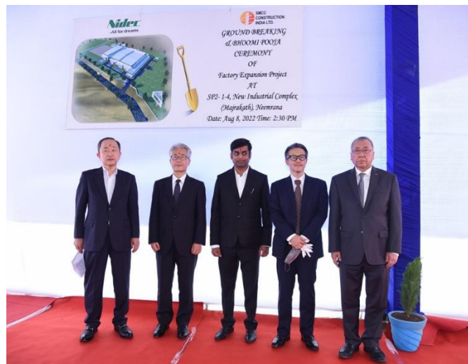
People attend the groundbreaking ceremony.

Nidec Corporation (TSE: 6594; OTC US: NJDCY) (the “Company”) announced today that Nidec India Private Limited (“Nidec India”), one of its subsidiaries, has held a groundbreaking ceremony of the new building to Nidec India’s existing factory (the second-phase construction) in Neemrana, Rajasthan in the Republic of India (“India”).